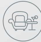
Airport Lounge Access