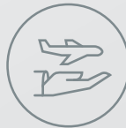
Complimentary Travel Insurance